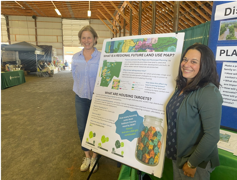
ACRPC staff promoting ACRPC's Future Land Use Map at the Fair