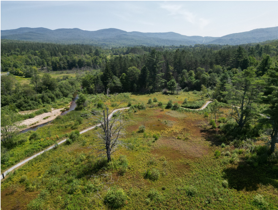
The Robert Frost Trail in the Moosalamoo NRA