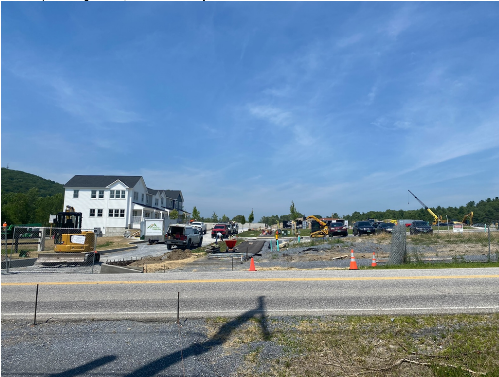
Stonecrop Housing development Middlebury