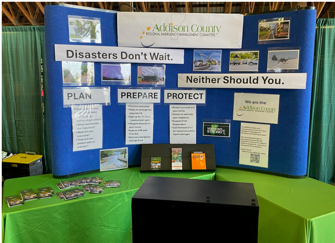
ACRPC booth at Addison County Field Days fair