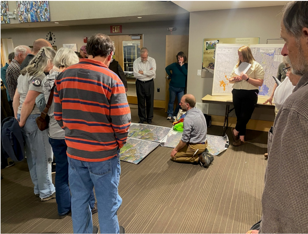
A mapping charrette at Middlebury College

regulations for high density transportation oriented development in portions of those communities near their railway stations.