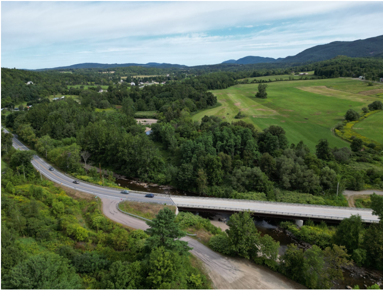
New Haven River and Route 116