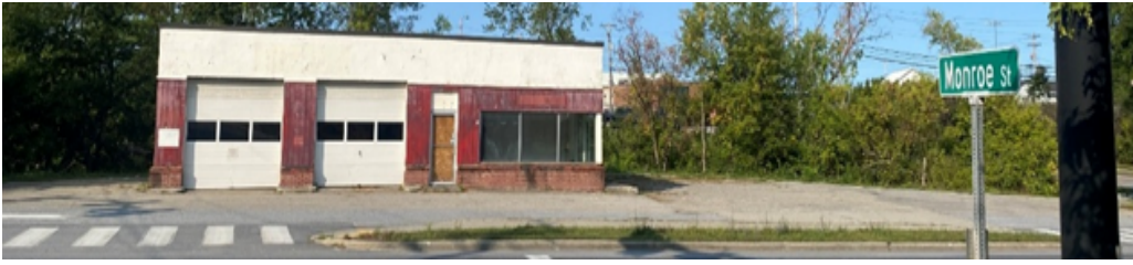
Former Maverick Gas station in Middlebury being redeveloped as new entrance to Middlebury High School