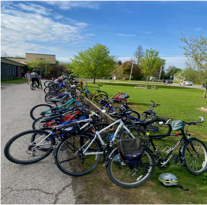
Middlebury elementary school