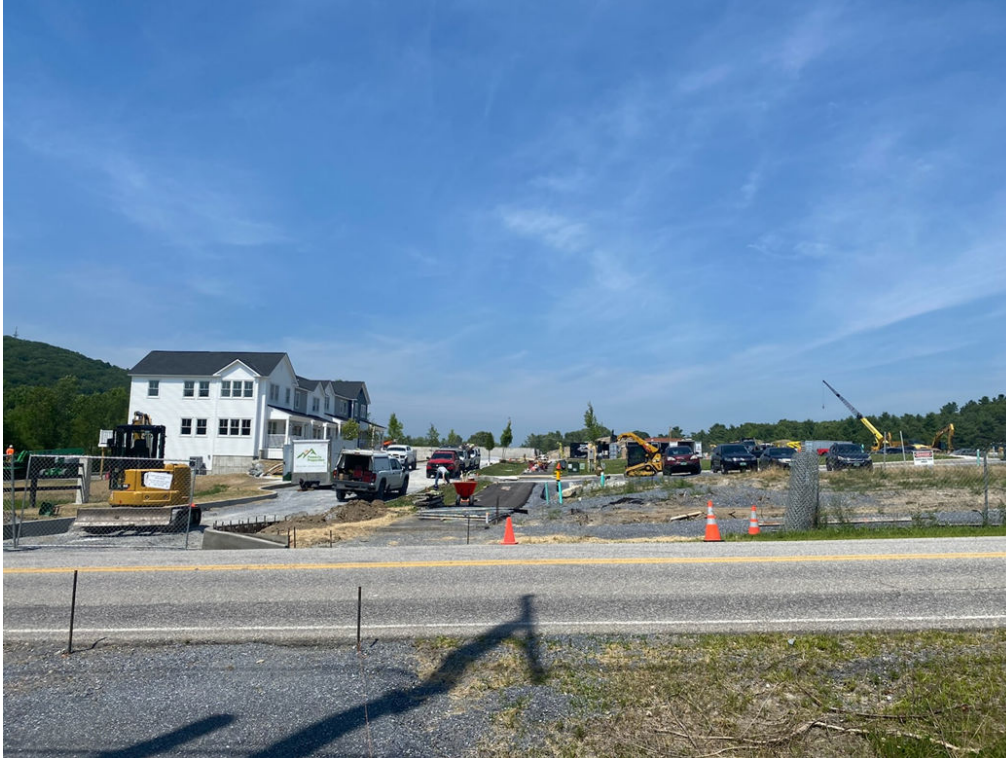
Stonecrop Housing development Middlebury