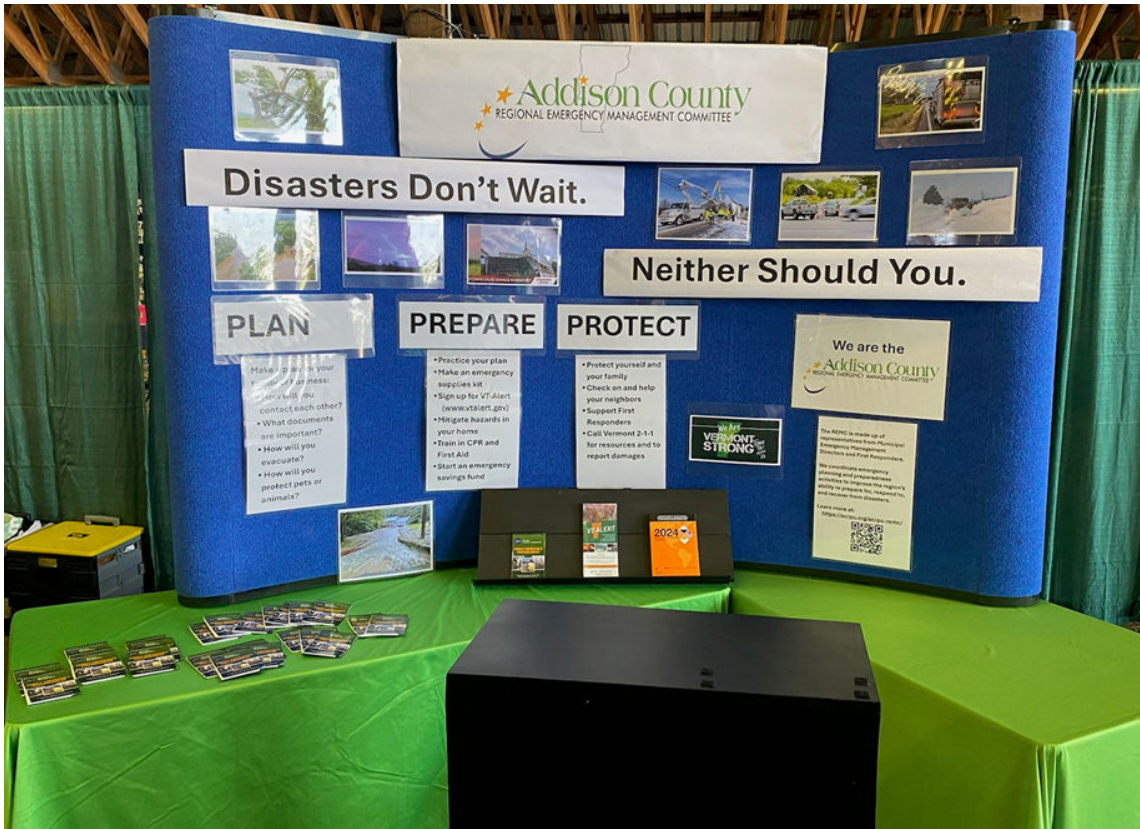
ACRPC booth at Addison County Field Days fair