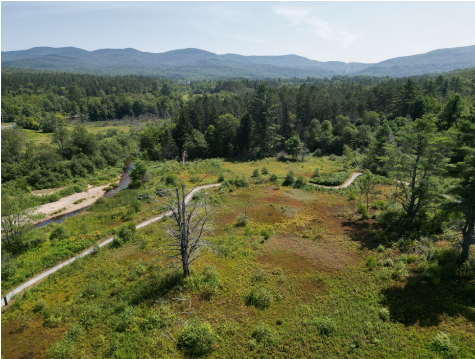
The Robert Frost Trail in the Moosalamoo NRA