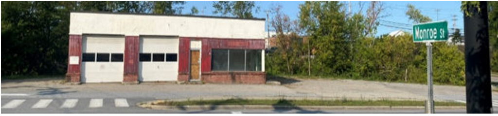
Former Maverick Gas station in Middlebury being redeveloped as new entrance to Middlebury High School