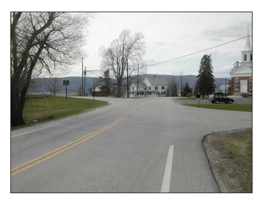
The intersection of Hamilton, Weybridge and Quaker Village Roads is a safety hazard for many pedestrians, especially children walking from the elementary school to the dairy for ice cream.

The study area is also very scenic, passing through open meadows and offering sweeping views of the Green Mountains, which makes this route popular with local residents and college students for jogging and bicycling. However, without the basic facilities, such as shoulders and sidewalks, bicyclists and pedestrians must compete with motorists for safe use of the road. Thus, in the fall of 2003, the Town contracted LandWorks to conduct this feasibility study and develop a plan that will provide a network that is safe and easy to use.