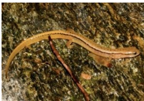
Northern Two-lined Salamanders- in Vergennes or Whiting

The Vermont Herp Atlas ( www.vtherpatlas.org ) needs photographs of two salamander species from a couple towns in Addison County: