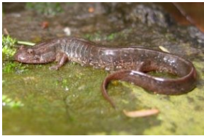
Northern Dusky Salamanders- in Orwell, Panton, Shoreham or Vergennes

Searching for stream salamanders can be done at almost any time of the year. Simply turning rocks, logs, and bark along the edges of small streams for an hour or two should reveal one or two of these species. Streams don't need to be any more than two or three feet across as long as they don't dry out during the summer. The small, mucky, seepage areas off to the sides of the streams are great places to find Northern Dusky Salamanders. Grab a small plastic container to help catch them, put on your muck boots, and see what you can find. Remember to send a couple photos of your discoveries to Jim Andrews at jandrews@vtherpatlas.org