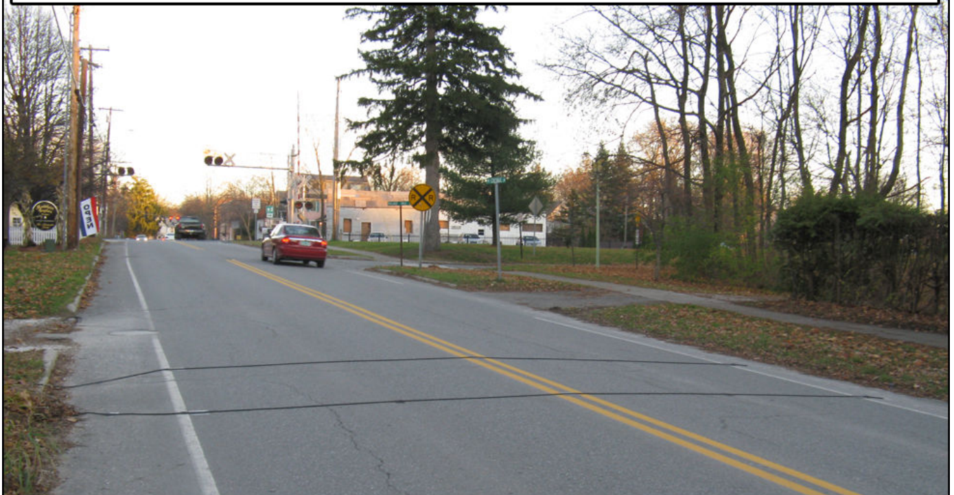
FIGURE 5: Harbor Road (SHEL-28 ATR setup) West of RR X-ing ~ Eastbound, 2010

ATRs were setup in 2010 and 2012 at GMPC Pole #6 between Athletic Drive and the Railroad crossing on Harbor Road, about 350 ft. east of where the radar feedback sign was eventually installed in 2012 (see Figure 5 ). This is the exact position where each of the ATRs were installed for both count periods.