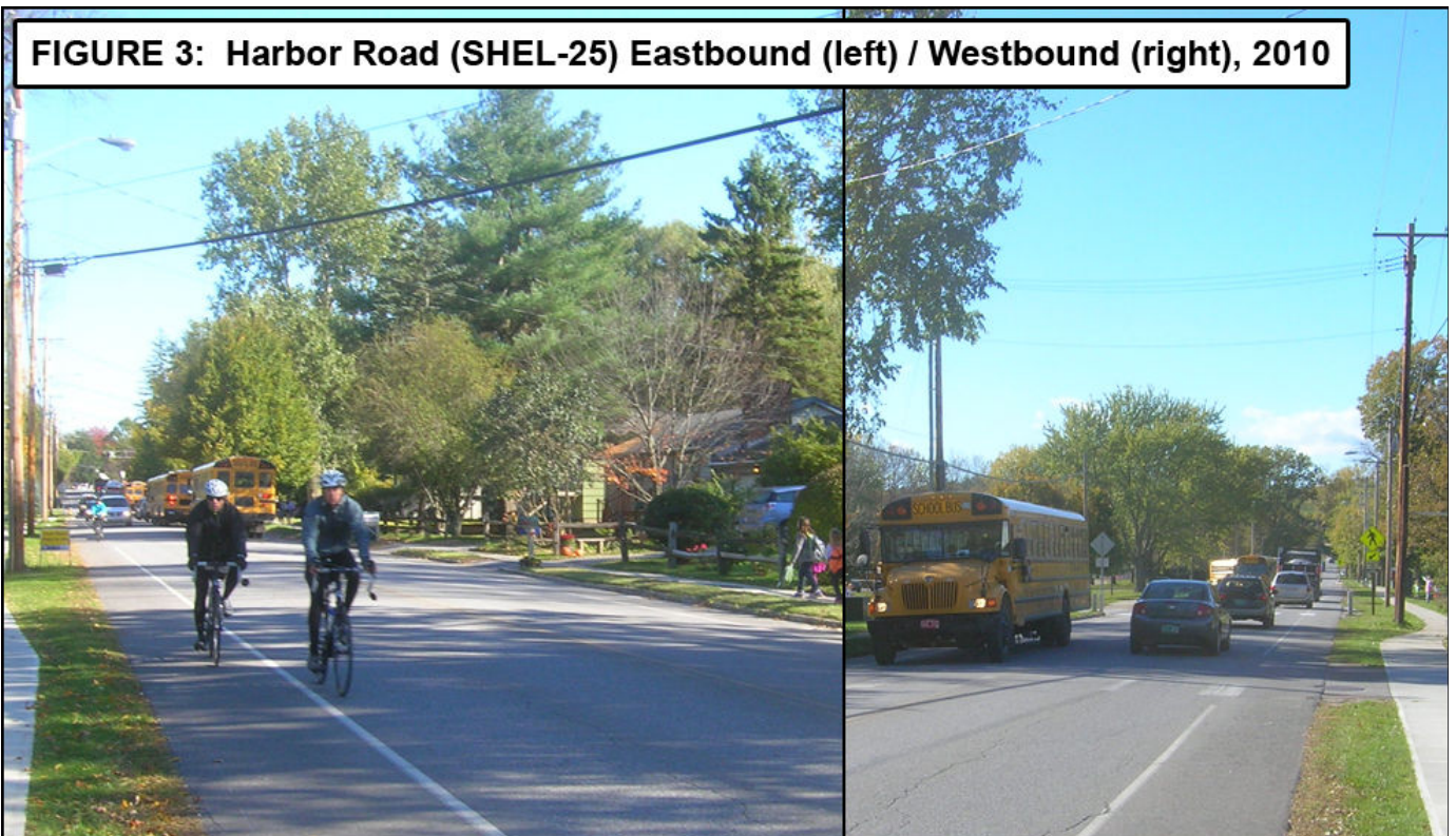
Figure 3 illustrates the school zone traffic just after school had been dismissed for the afternoon. Although pedestrians had been observed to consistently use the sidewalks (left), there were also a high number of bicyclists and school busses sharing the road, which ensured low traffic speeds during this time-period. The 2006-2012 ATR installations were setup on the 1 st telephone pole shown in the eastbound view of Figure 3 , and in the westbound view in Figure 4 ,