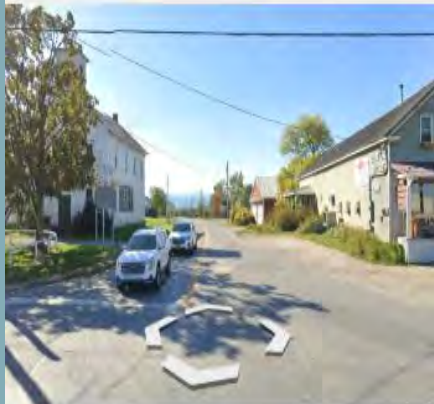
End Project (Looking West)