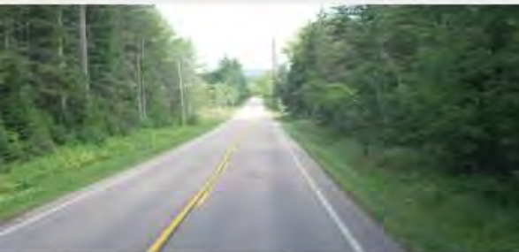
VT-125 in Ripton looking West