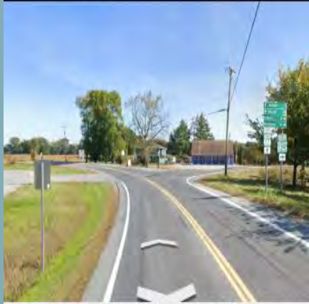
Begin Project (Looking East)