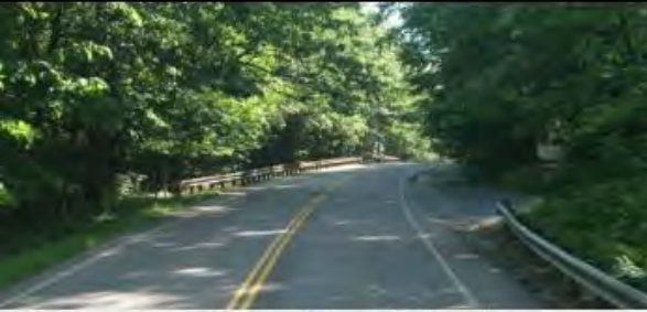
VT-125 in Middlebury looking East